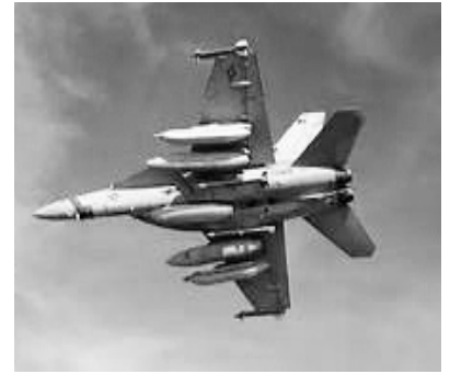
Growler courtesy of NW Public Radio.

The permit allows the Navy to operate the transmitter trucks up to 260 days a year, for 8 to 16 hours each day. The trucks would be surrounded by yellow caution tape when operating on the national forest.