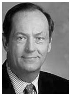
Senator Bill Bradley

In June, Olympic Park Associates and other organizations welcomed former U.S. Senator Bill Bradley to Seattle's Benaroya Hall to reflect on the Elwha River restoration and its larger implications for ecological restoration. Senator Bradley was a major sponsor of Elwha River Fisheries and Ecosystem Restoration Act. As chair of the Energy and Natural Resources Committee, his leadership was central to the bill's passage.