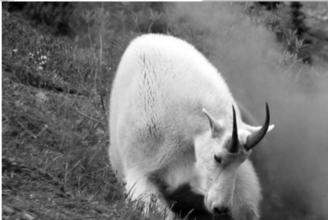
Non-native mountain goats create wallows in fragile alpine meadow.