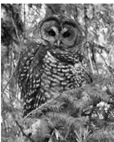
Endangered Spotted Owl