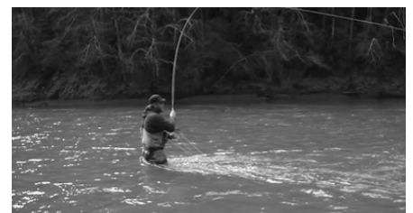
Fly fisherman on the Hoh. Prop. W n S River Lateral Line Media.

The Hoh is one of the great western rivers, renowned for its wild salmon, wildlife, and its world-class temperate rainforest. The new recreation and conservation area is a successful example of restoration and non-motorized recreation complementing the upstream protection offered by Olympic National Park.