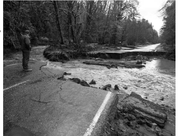
Elwha Road Washout.

With climate-driven increase in the frequency and intensity of winter storms in our area, nature continues to “bat last” on floodplain roads.