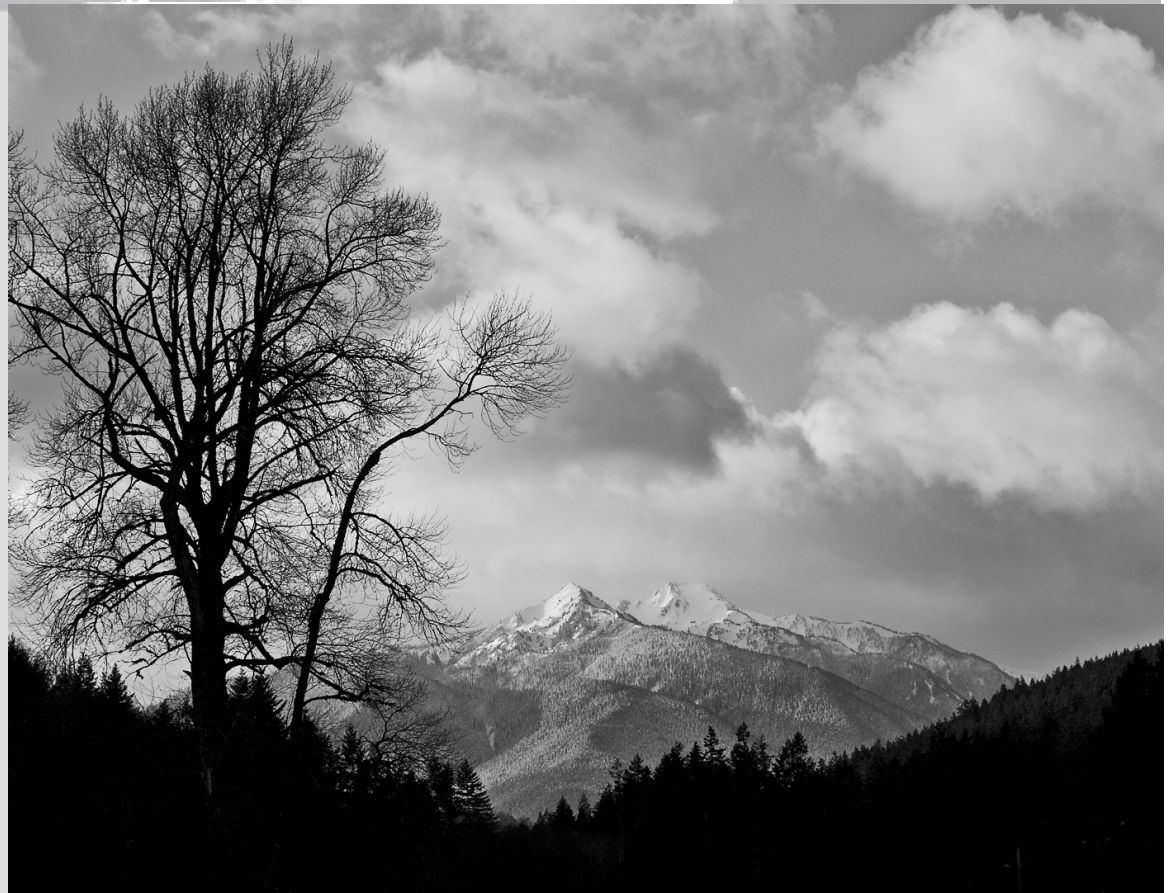
Elwha, Fitzhenry, Snow Clouds.