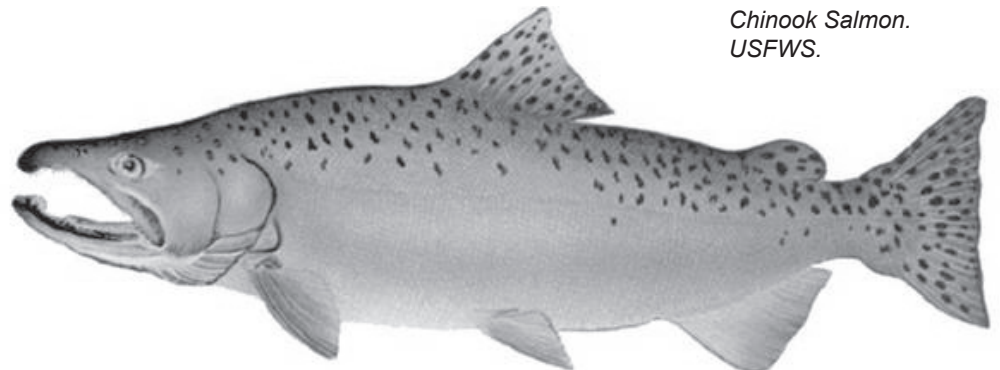
Chinook Salmon.