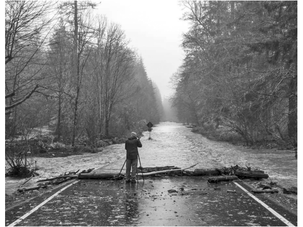
Sanders Creek.

OPA is committed to restoring permanent access up the Elwha valley that will accommodate the natural processes of the Elwha River. The ecological restoration of Elwha River ecosystem has been the focus of nationwide attention, and the public deserve to be able to witness this ongoing process. Park staff also need vehicle access to maintain existing infrastructure and visitor services in the valley. But we believe any future access should be of a scale and character consistent with the existing Hot Springs and Whiskey Bend roads. OPA will continue to closely monitor this important planning process.