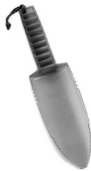
GSI Cathole trowel 3 oz, $5, recycled plastic