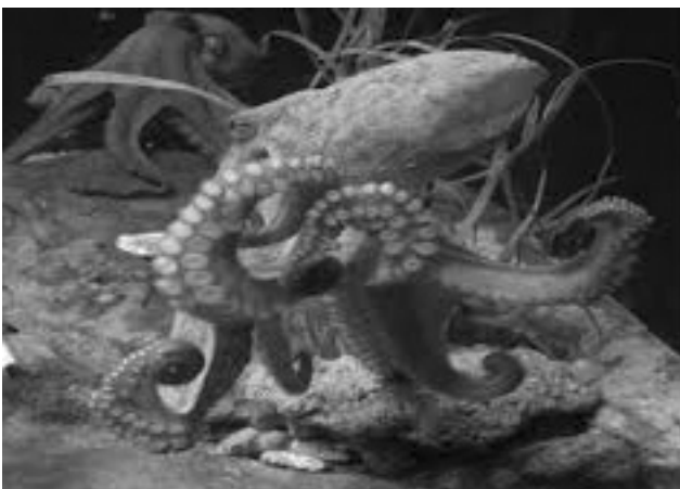
Good news for our Giant Pacific Octopus, Enterocampus dofleini.

Senator Maria Cantwell deserves our thanks for her leadership efforts on this issue and other efforts to defend our public lands.