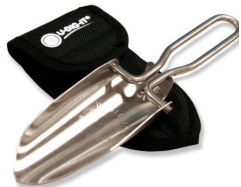
The U-Dig-It® Pro, 5 oz, $15 stainless steel, folding handle, stuff sack.