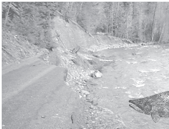
Dosewallips road washout, looking downstream...

The Forest Service's preferred alternative for the Dosewallips is to reconstruct the road in its