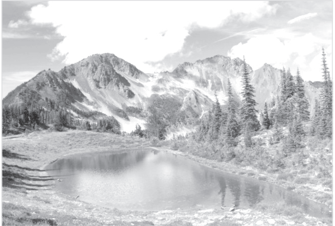
Mount Appleton and Oyster Lake.