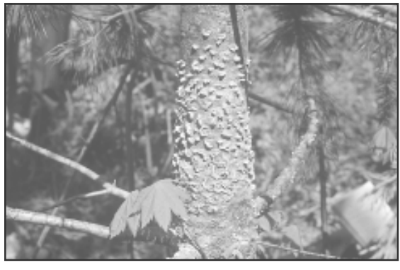
Blister rust on pine near Soleduck Bridge, 1969.

early 1900's on pine seedlings imported from Europe. By World War II the magnitude of its destruction was overwhelmingly apparent. To complete its cycle blister rust must infect at least two different hosts. Part of its life is spent on gooseberries and currants (of the genus