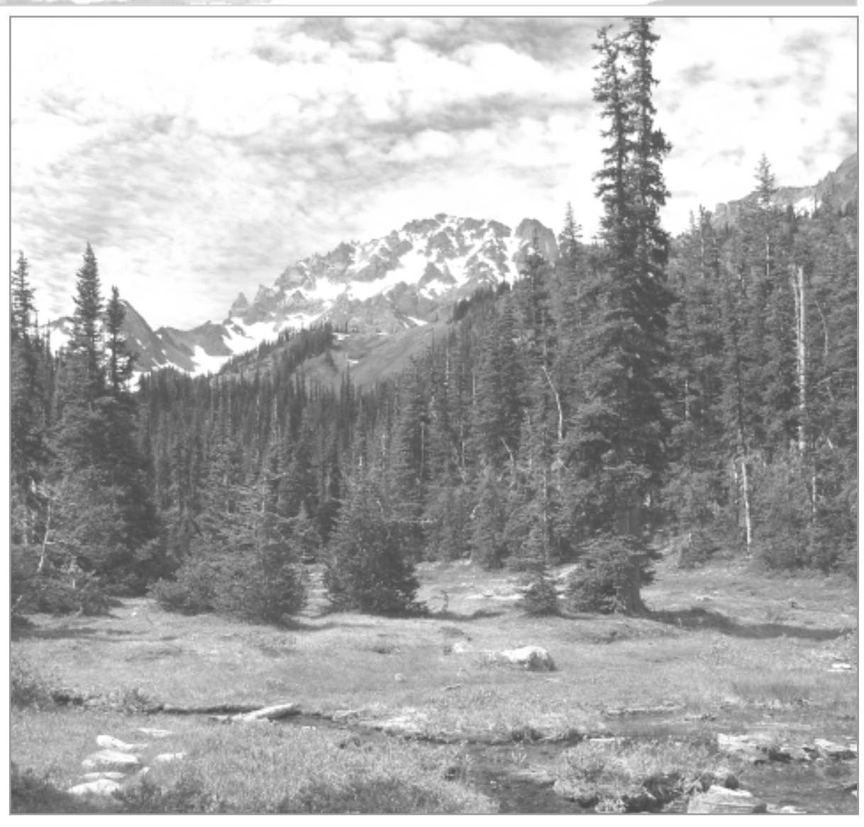
Mt. Deception at Royal Lake.

OPA Meetings Congressional Contacts 2004 Northwest Wilderness Conference Bush Administration Continues Attacks on Public Lands: Wilderness Outsourcina Reckless Roads (RS 2477) Wave Energy Proposal in Marine Sanctuary The "Big-Boxing" of Sequim Where Have Pine Trees Gone? 7 Washouts From October Storms 8 High Dose Bridge Replaced Washout: Another Perspective Wilderness Legacy 10 Friends of Marine