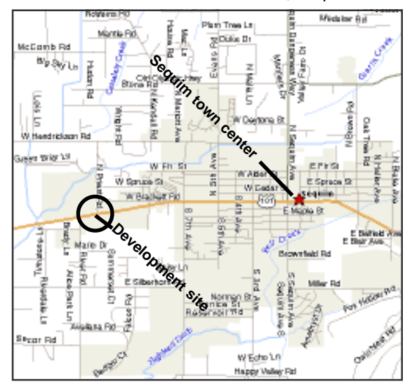
Continued on P. 7, Sequim First .

The city leaders envision money in the city coffers from the taxes and increased use of services that these huge stores within their city limits will provide. They have no perspective