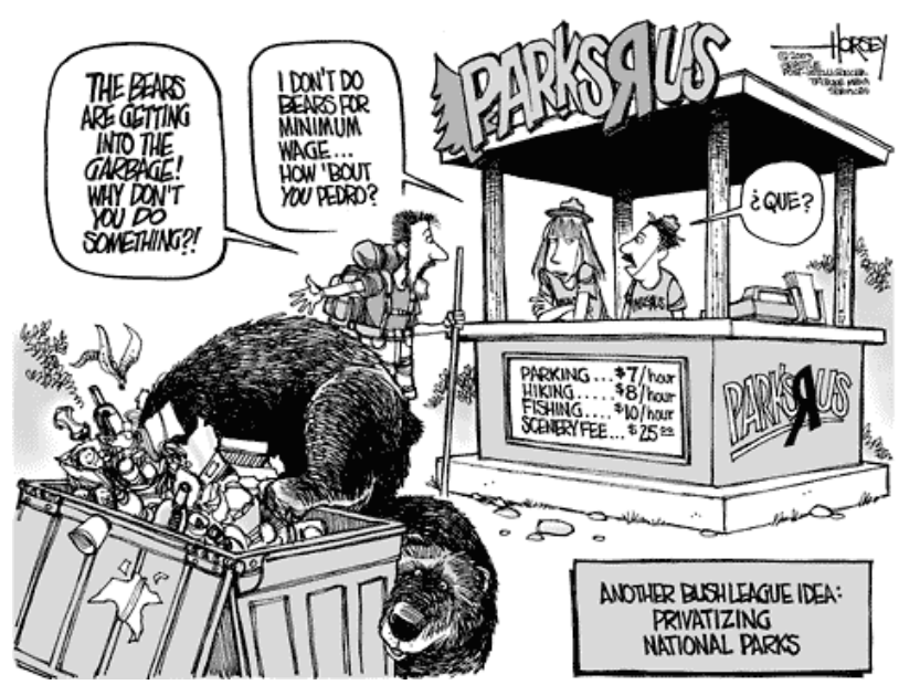
Copyright 2003, Seattle Post-Intelligencer . Reprinted with permission.

Nevertheless, National Park Service staff will still be spending scarce time and scarce resources on outsourcing studies in FY04, but Congress has expressed serious reservations, and is demanding greater oversight, for national park staff outsourcing.