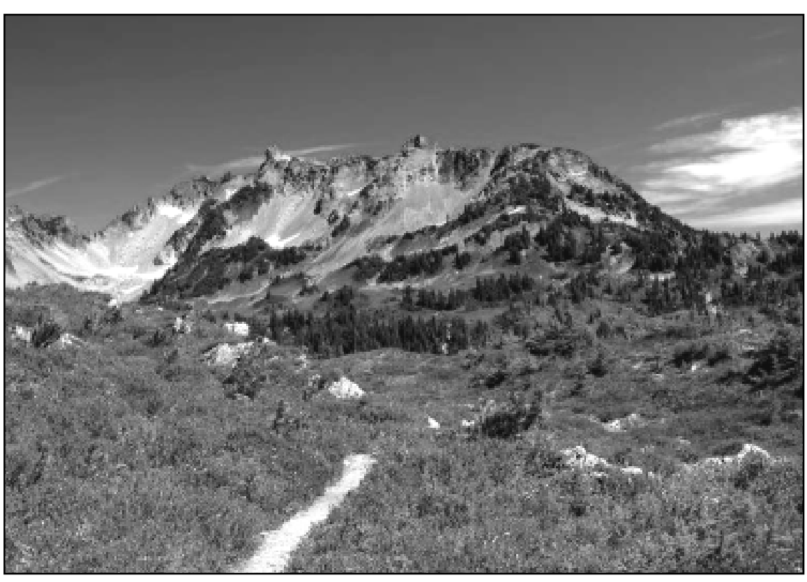
Mt. Seattle, west side, Skyline Trail.

One more thought to clarify, on your next trip, accompanying these five or your new essentials in your pack I recommend a pocket knife, some duct tape, and a light-weight flashlight. Happy Trails!