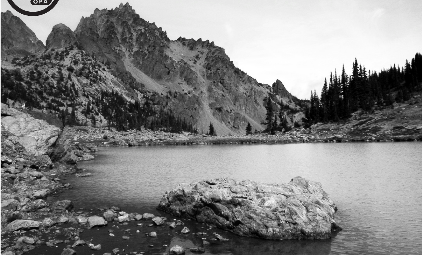
Upper Royal Basin, Olympic Wilderness.