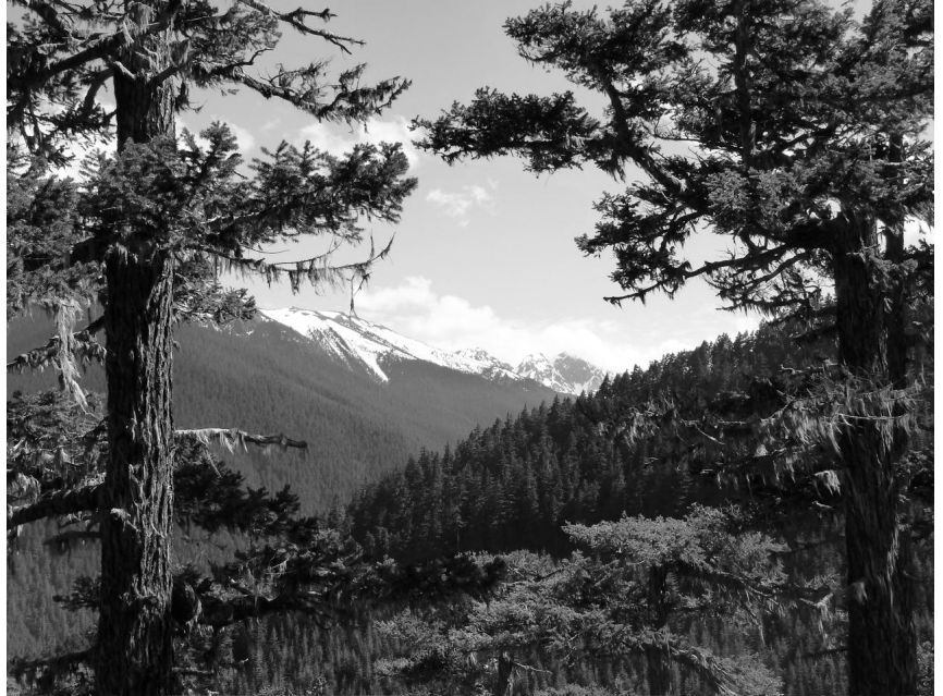
Middle Fork Dungeness.

All of this is done without many of us ever stepping a boot into a wilderness area. Wilderness functions best when we don't spend