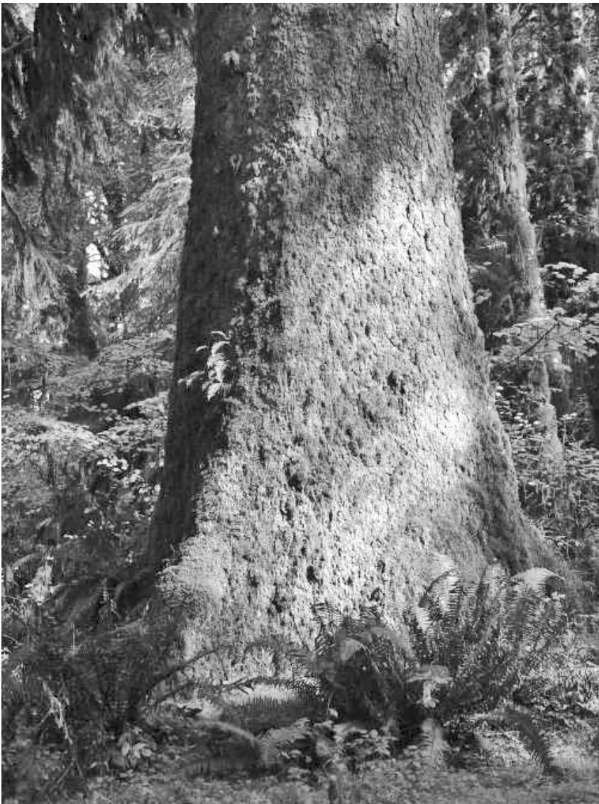
Queets spruce.

For the full text of OPA's letter, visit www.olympicparkassociates.com