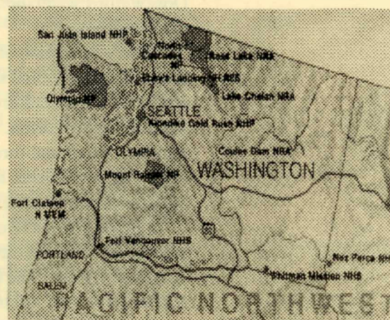
What we might have lost under HR 260:

OPA wrote a strongly worded letter to Rep-